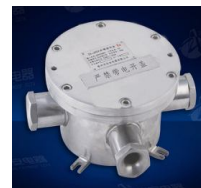
ZAJXD4 JUNCTION BOX