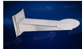
ZAZ610B WALL BRACKET